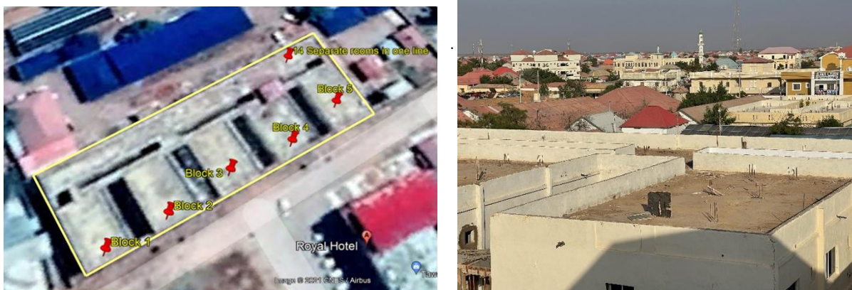
Figure 3: Proposed roof

The hospital does not have much space on the ground and the management suggested that the PV panels to be mounted on the roof of the 5 building blocks for the covid-19 Centre. Each block measures 18m by 10m. The distance from the proposed PV mounting area to the location of the current inverters is around 80m.