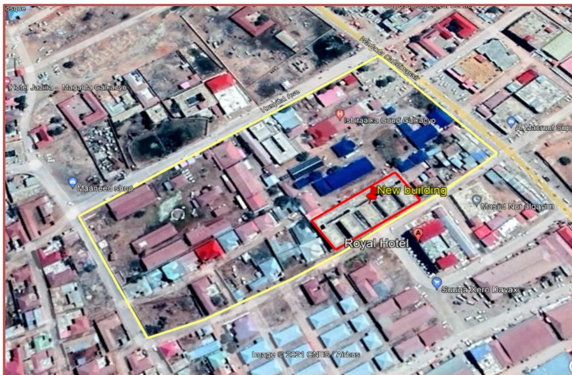
Figure 1: General map of Mudug Regional Hospital (Lat: 6.770388°, Long: 47.427146°)

Galkayo Hospital was founded by the Italians in 1935 and is located at the Centre of Somalia, and on the main road of Galkayo town. The hospital treats generously patients from all the regions of Somalia and some parts of Ethiopia and even as far as Kenya's northeastern province. Galkayo general hospital is a large and complex hospital consisting of different medical and clinical departments, the hospital provides free medical services to a large number of patients from different corners of the town. The hospital also provides a free service to the IDPs, returnees, pastoralist, Ethiopian refugees and minority marginalized clans within the town and its vicinity. The hospital has 500 beds and employs 314 staff comprising nurses, paramedical, internship medical students, guards, cooks, cleaners, etc. The total qualified medical doctors operating in the hospital are 27 doctors. The hospital has emergency ward, OPD, MCH, Maternity, TB section, X-Ray department, surgical, laboratory and 6 rooms for COVID-19 in ground floor of the Isolation wing. The isolation Centre for COVID-19 and other infectious diseases has 90 rooms but it needs to be rehabilitated and connected to electricity. This COVID-19 isolation wing/Centre is a community initiative project, whilst the collected funding was drained off and till today it remains priority number one for the hospital and for the community.